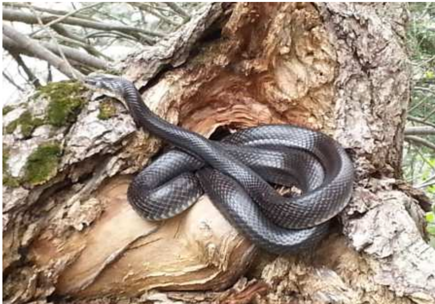
Not seeing a lot of outsiders, the local wildlife enjoys the parade of rigs