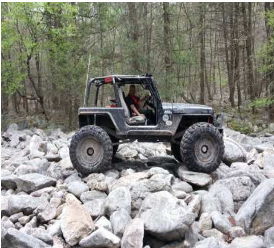
Rocky Road was no match for Kurt's YJ, whose steady diet of Jeep Growth Hormones barely shows